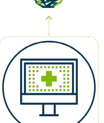
BFN ADMIN SYSTEM INTEGRATION